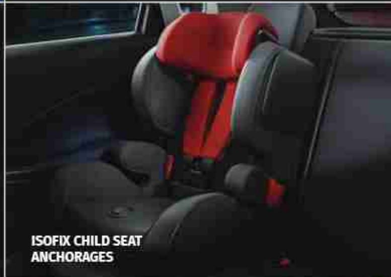
ISOFIX CHILD SEAT ANCHORAGES