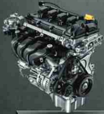
ADVANCED K SERIES DUAL JET, DUAL VVT ENGINE