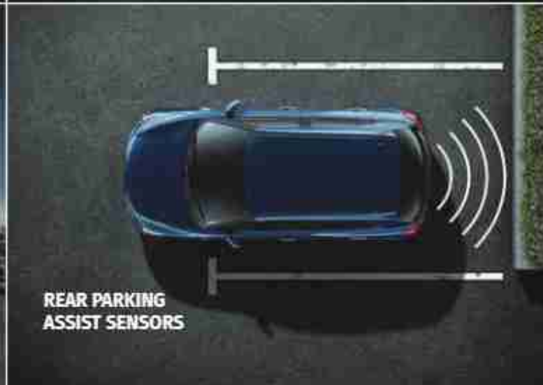
REAR PARKING ASSIST SENSORS