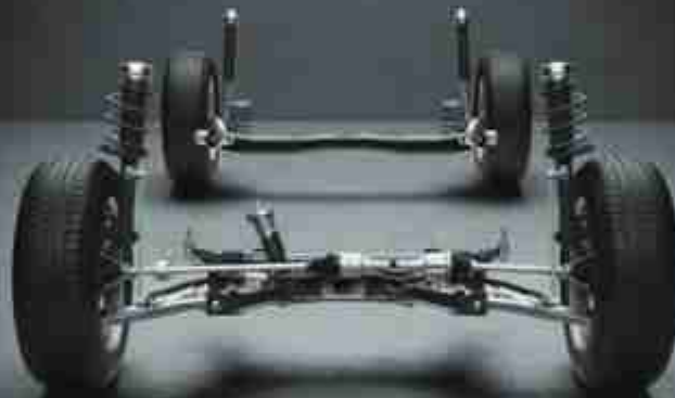
ALL NEW SUSPENSION