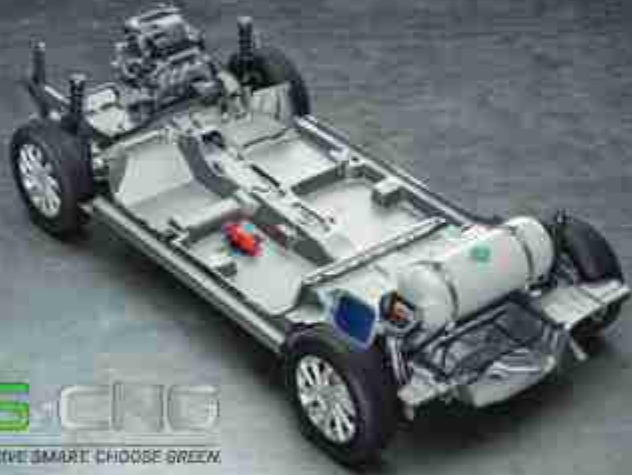
S-CNG DRIVE SMART. CHOOSE GREEN.