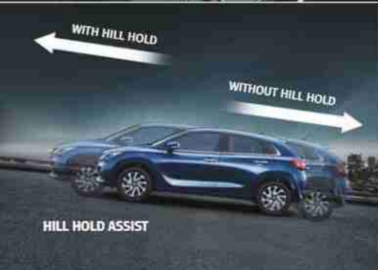
HILL HOLD ASSIST