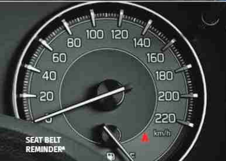
SEAT BELT REMINDER*